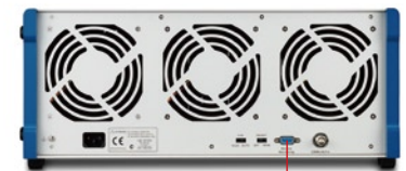
Remote Monitoring Port