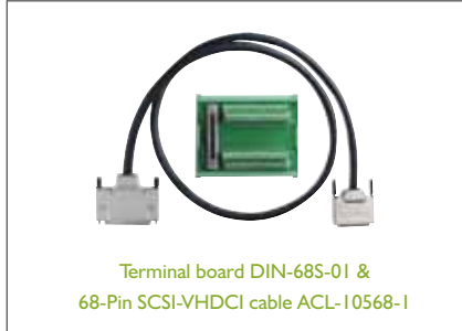
Terminal board DIN-68S-01 & 68-Pin SCSI-VHDCI cable ACL-10568-I