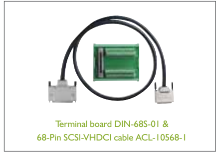
Terminal board DIN-68S-01 & 68-Pin SCSI-VHDCI cable ACL-10568-1

Terminal Board with One 68-pin SCSI-II Connector and DIN-Rail Mounting (cables are not included; for information on mating cables, refer to Section 14, Accessories.)