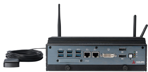
MXE-5400 with Antenna