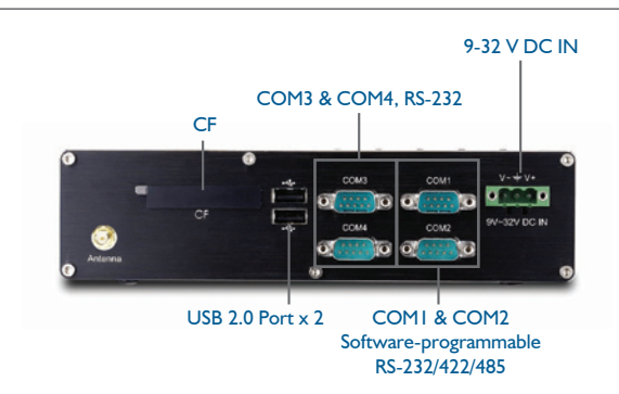
MXE-3000 Back Panel