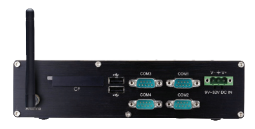
MXE-3000 with Antenna